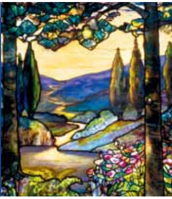
Louis Comfort Tiffany U.S., 1848–1933 River of Life , ca. 1905 Favrile glass, copper foil, lead Long term loan from the Denkmann Family

What makes this scene look peaceful? This window was once installed in the Denkmann family mausoleum in Chippianock Cemetery in Rock Island. A mausoleum is a small burial place for several individuals, usually from the same family.