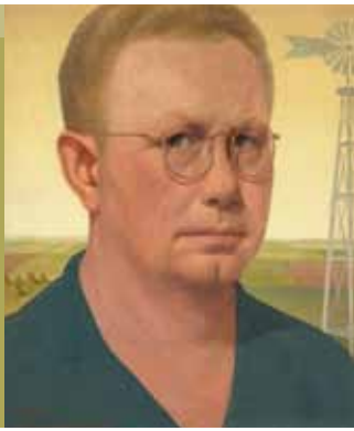
Grant Wood U.S., 1891–1942 Self Portrait , 1932 Oil on panel Museum purchase: Friends of Art Acquisition Fund, 1965.1

Who is this man, and why is he important? Meet Grant Wood, Iowa’s most well-known artist! Grant Wood painted this self portrait, a picture of himself, two years after he painted American Gothic , one of the most famous paintings in the world. This painting is special because it is the only self portrait that Grant Wood painted.