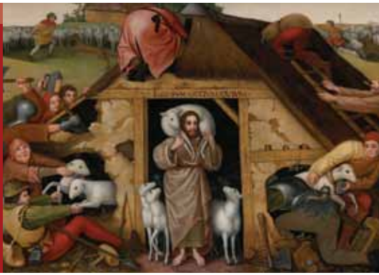
Circle of Pieter Bruegel the Elder Flanders, ca.1525/30-1569 The Parable of the Good Shepherd , ca. 1565 Oil on panel Gift of C.A. Ficke, 1925.32

Why are these people trying to steal the sheep? The people illustrate part of the Biblical verses (John 10:1-18) that say, “He who does not enter by the door into the sheep-fold but climbs up some other way, is a thief and a robber. But he who enters in by the door is the shepherd of the sheep.”