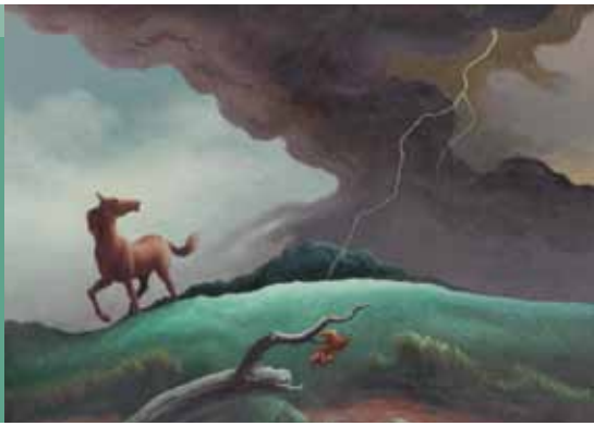
Thomas Hart Benton U.S., 1889-1975 Spring Storm , 1958 Tempera on board Museum purchase: Friends of Art Acquisition Fund, 1988.12

Why is this horse scared? A storm has developed suddenly and the horse doesn't have any shelter in sight! Like Grant Wood, Thomas Hart Benton was a Midwest Regionalist who painted the people and places of the Midwest.