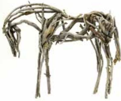
Deborah Butterfield U.S., b. 1949 Half-Moon , 2007.38 Cast bronze, polychrome patina Museum Purchase with funds provided by an anonymous donor, 2007

What material did the artist use to create this sculpture? Although the sculpture looks like weathered wood, the material is actually cast bronze. Believe it or not, the sculpture weighs 2,400 pounds!